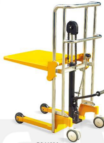
PS4120A (with optional noise-free castor)